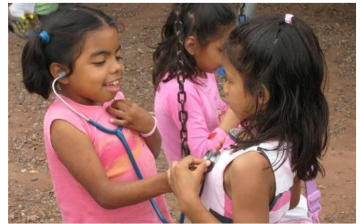
CENTRAL AMERICAN VILLAGES

4. Do you have any special dietary or medical needs, or do you have any allergies?